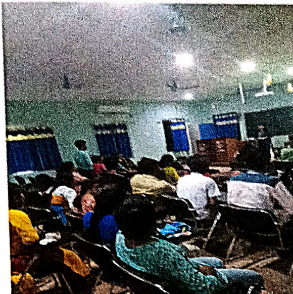
Interaction with the students with the help of laptop