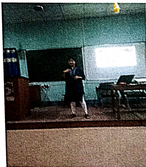
Interaction with students

Frequently asked questions at the time of interaction with students :